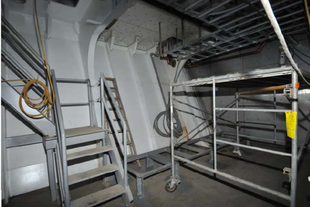
Engineering Operating Station