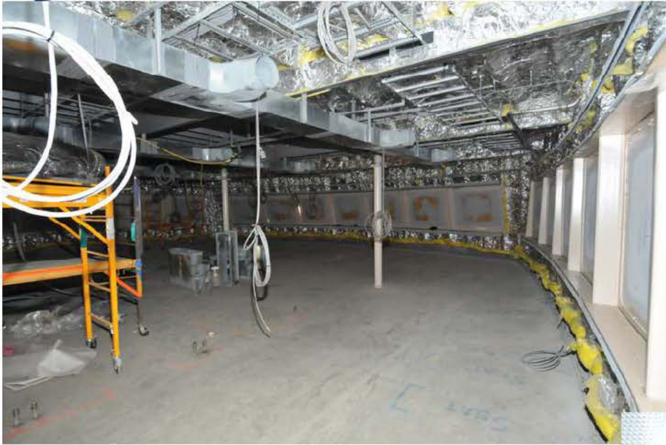
← 02 Deck Forward Passenger Space with insulation, ventilation and wiring being installed.