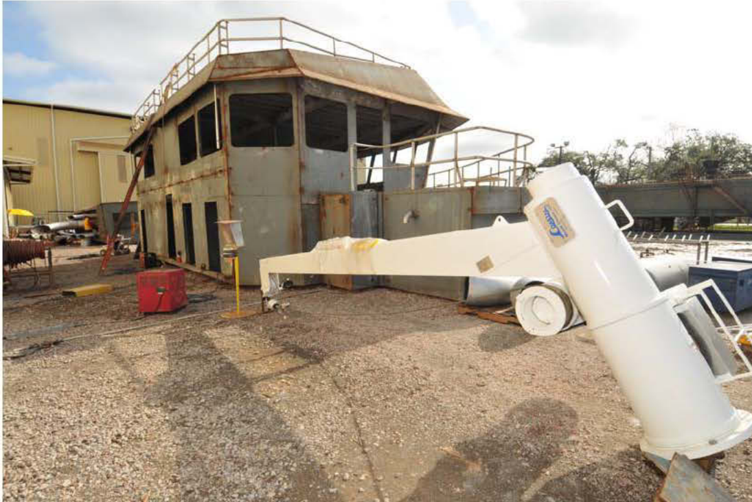
↑ Pilohouse off vessel and Rescue Boat Davit