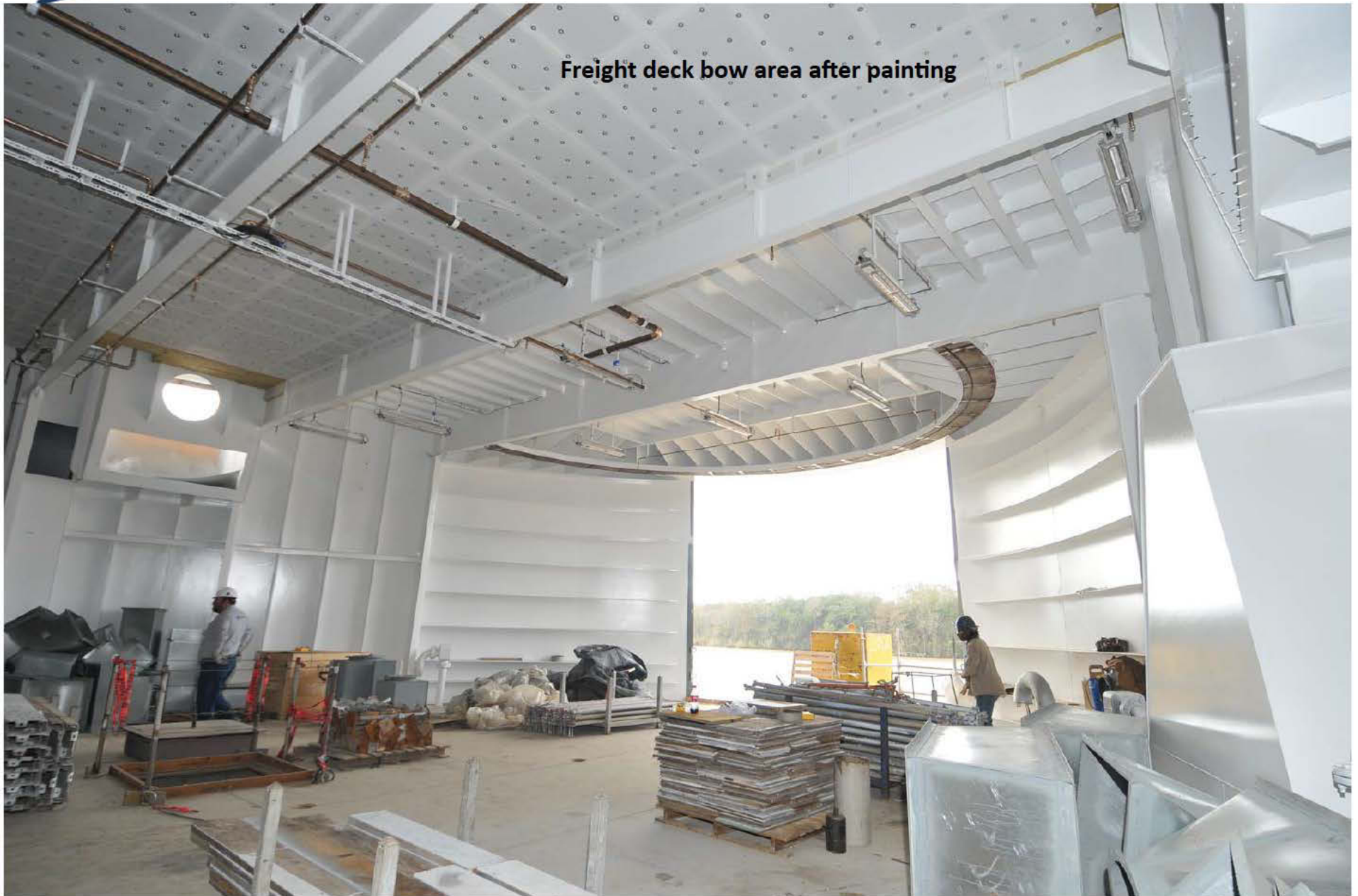
Freight deck bow area after painting