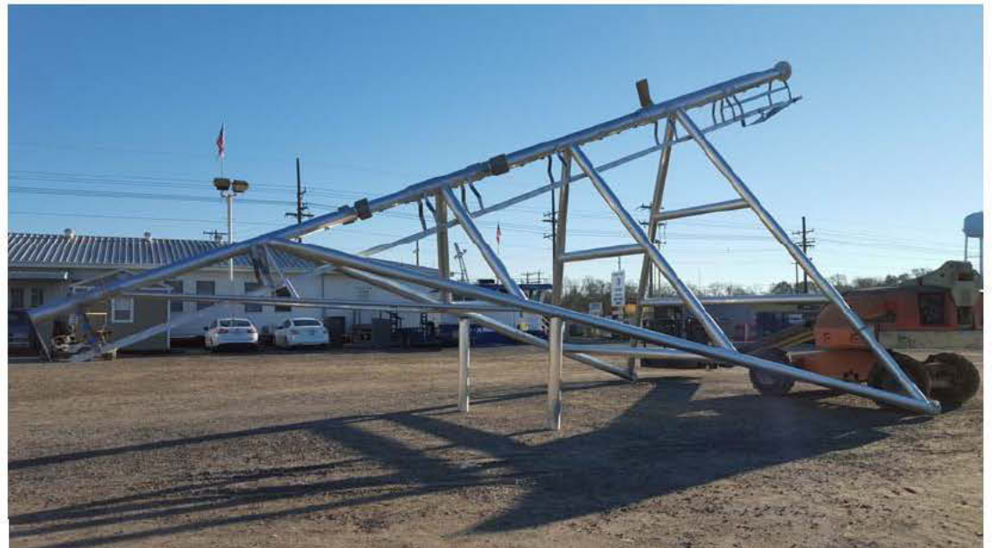
Aft Navigation Lighting Mast →