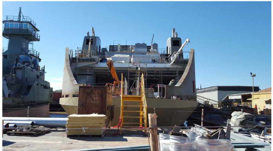
Stern view →