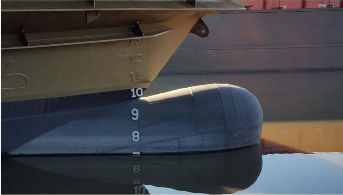
← Bulbous Bow during construction