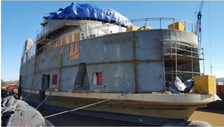
← M/V Woods Hole Forward Bow View at Conrad Aluminum Yard with Pilothouse