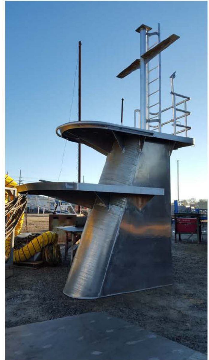
→ Forward Mast for Navigation Lighting and Radars