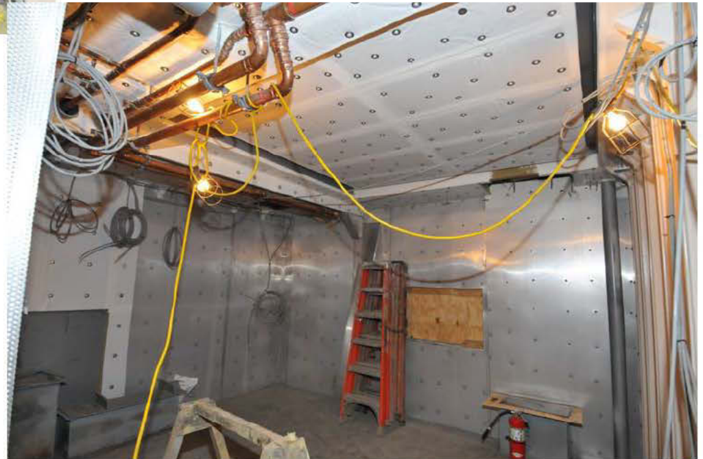
03 Deck Machinery space with insulation, piping and wiring being installed. →