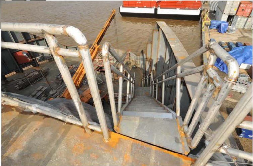
Aft stair (ladder) from 02 to freight deck →