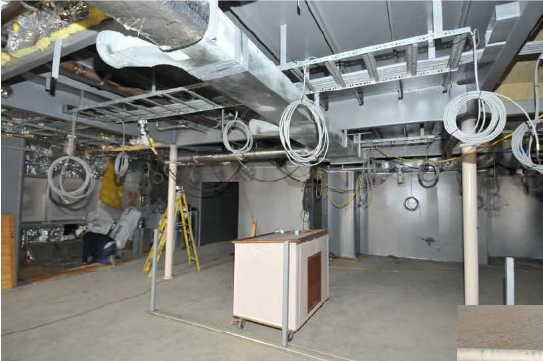
← 02 Deck Aft Passenger Area under construction