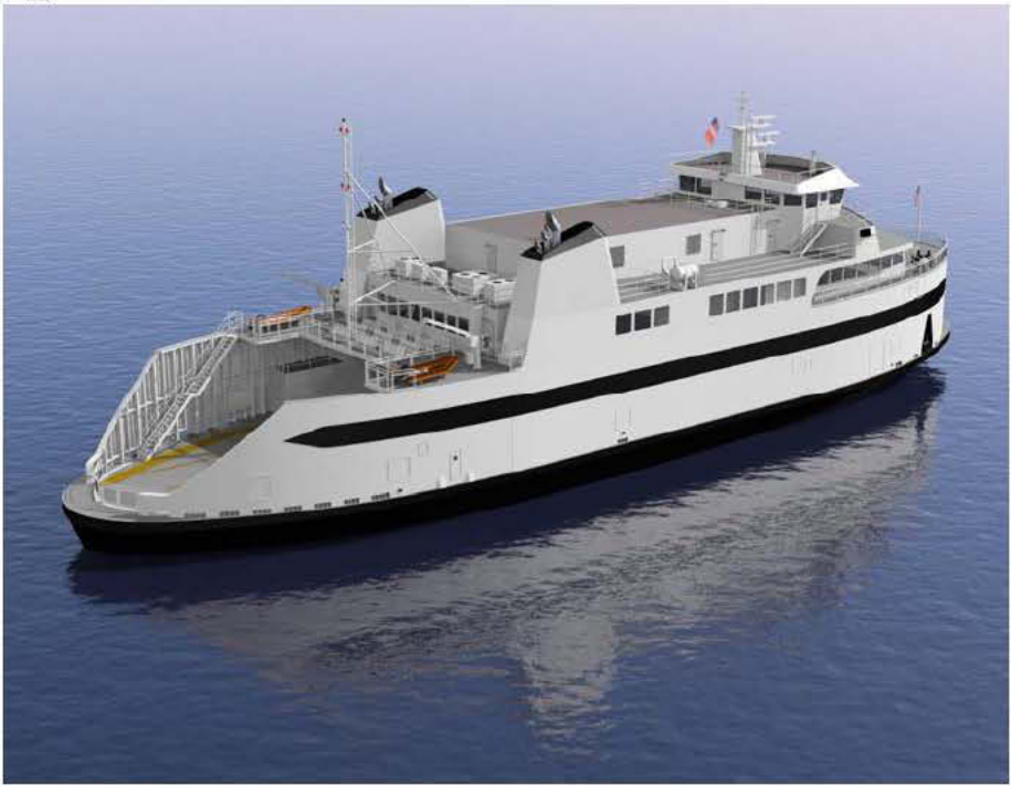
Outward Profile and Renderings of the M/V Woods Hole