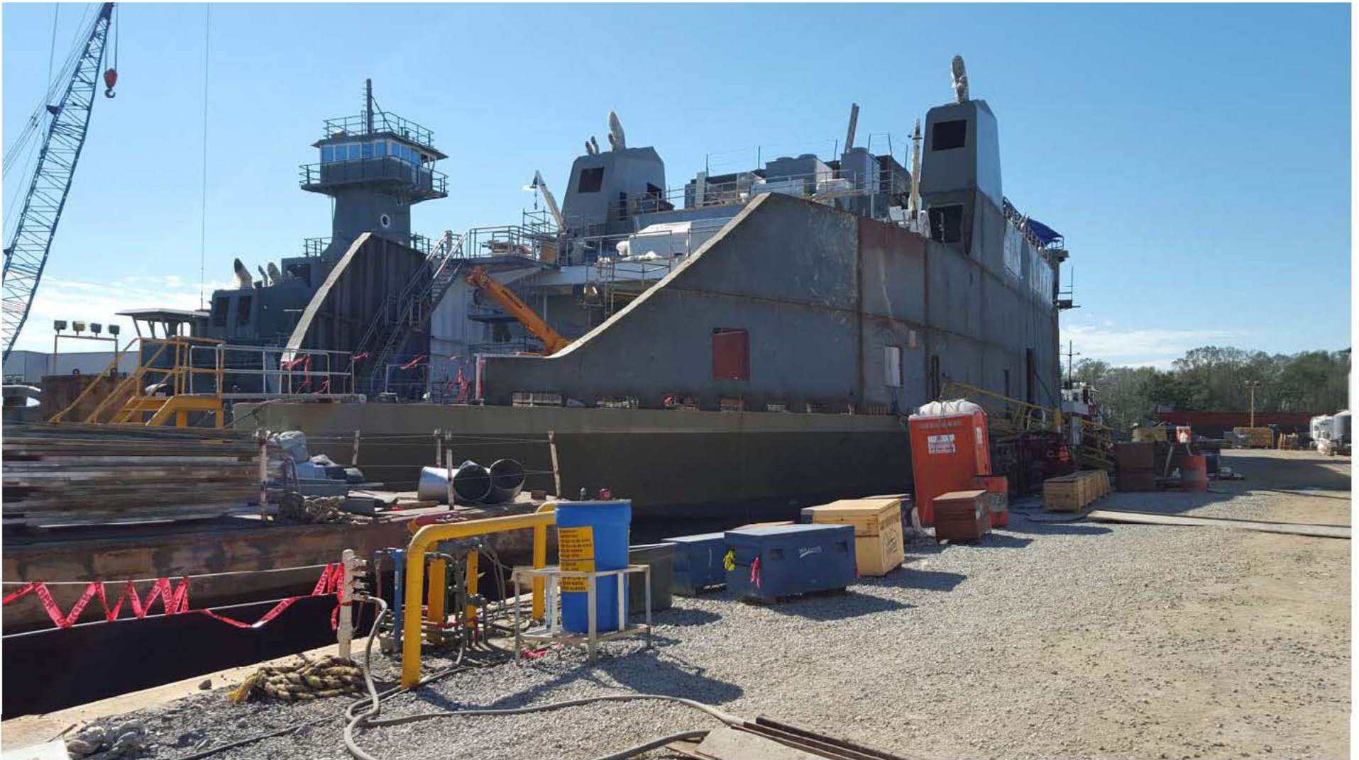
Starboard Aft View