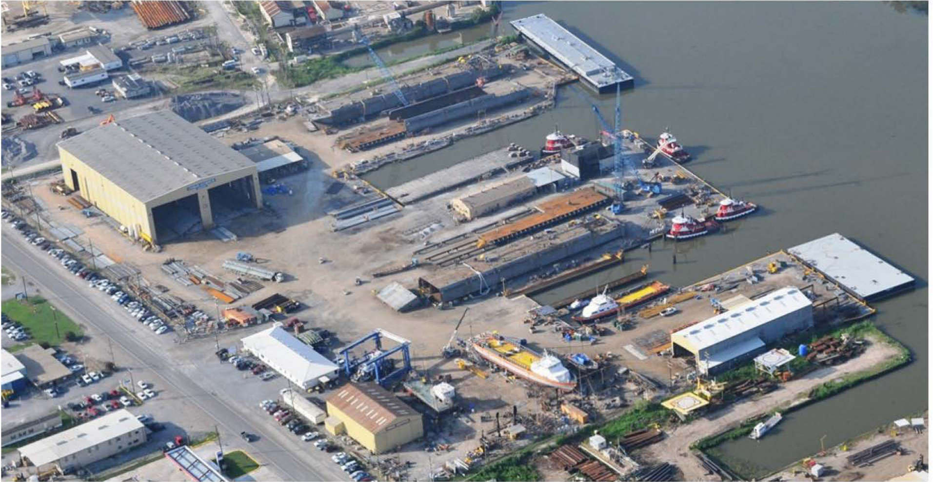
M/V Woods Hole was moved to Conrad Aluminum at Amelia, LA